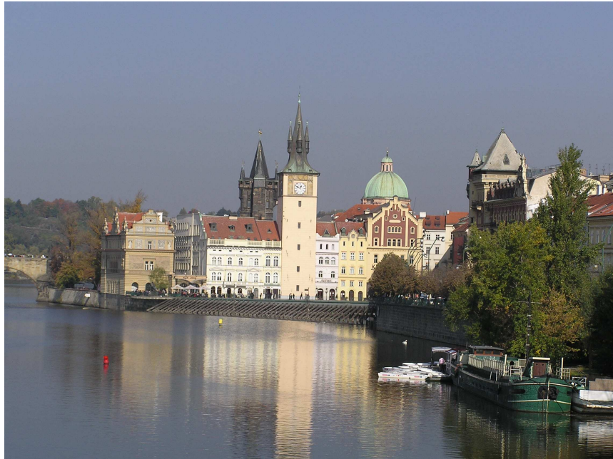
Buildings of Czech Association of Scientific and Technical Societies