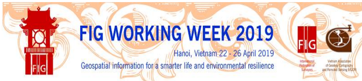
FIG Working Week Hanoi

This year the FIG working Week was held from 22 nd to 26 th April in Hanoi, Vietnam. Almost 1,000 delegates from 90 countries participated. CLGE was represented by a strong delegation.