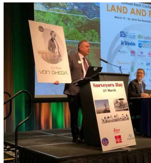
Figure 4 – Closing ceremony of the WB conference, Washington, 23 March 2018