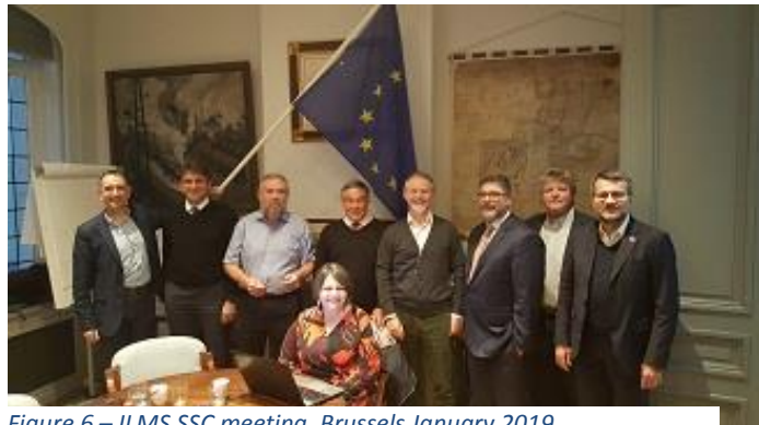
Figure 6 – ILMS SSC meeting, Brussels January 2019

The launch process will continue at the World Bank Land Conference March 2019 (25th – 29th March) and FIG Working Week in Hanoi April 2019 (22nd – 26th April)