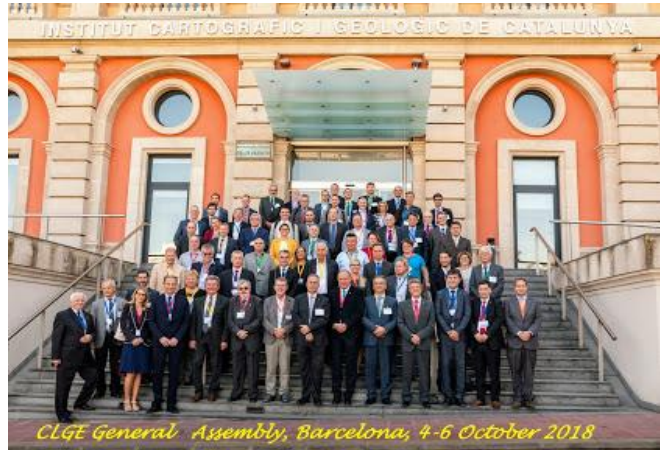
Figure 2 – Group picture of the GA, Barcelona October 2018

Thirty two national associations were represented. Sincere thanks must go to Colegio Oficial de Ingeniería Geomática y Topográfica (COIGT) for the work they invested in ensuring a flawless general assembly. All the arrangements were to the highest standards. Thanks also to the Institut Cartogràfic i Geològic de Catalunya for providing such a superb venue for our deliberations.