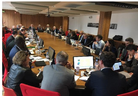
Figure 3 – Round table on SFfP, Paris January 2018

The "Paris round table" took place on the 29 th of January in the seat of OGE, Avenue Hoche, in Paris. The idea was for the Interest Group IG-PARLS (Publicly appointed and regulated liberal surveyors) and the Ordre des Géomètres-Experts (OGE) to organize a round table on methodologies and practices for the sustainable security of land rights, in collaboration with the other actors of the land governance sector (notaries, land administrators, other professionals, researchers).