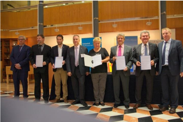
Figure 5 – Signing ceremony of the CPQPS, GA, Barcelona October 2018

Now, nearly all the countries which signed the previous document called "Accord Multilateral" have signed the new version called CPQPS. The Grand Duchy of Luxembourg hasn't signed yet, but due only to practical problems in not being able to participate in one of the last meetings. Bulgaria will sign in Sofia, during the spring GA which it's organising. Lithuania is the last member that has still to join from the previous signatories. We are still promoting this code to all our members.