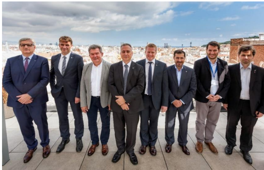
Figure 1 - The incoming CLGE Executive Board, Barcelona October 2018

We hope that this document will be helpful and are open to any suggestion and remark. We wish you a nice reading.