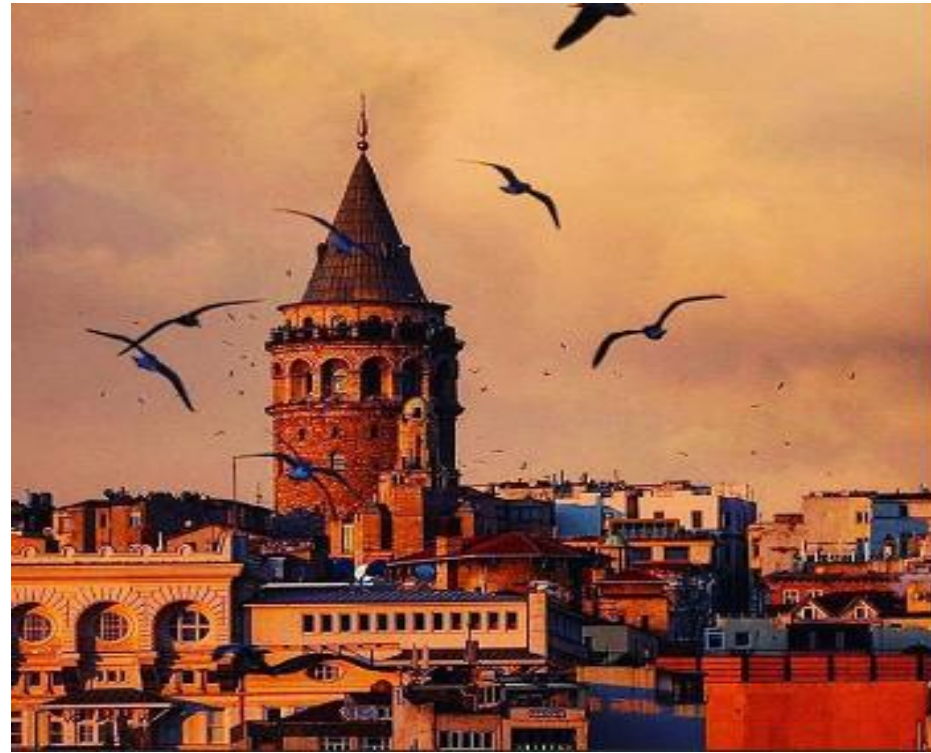
THE GALATA TOWER