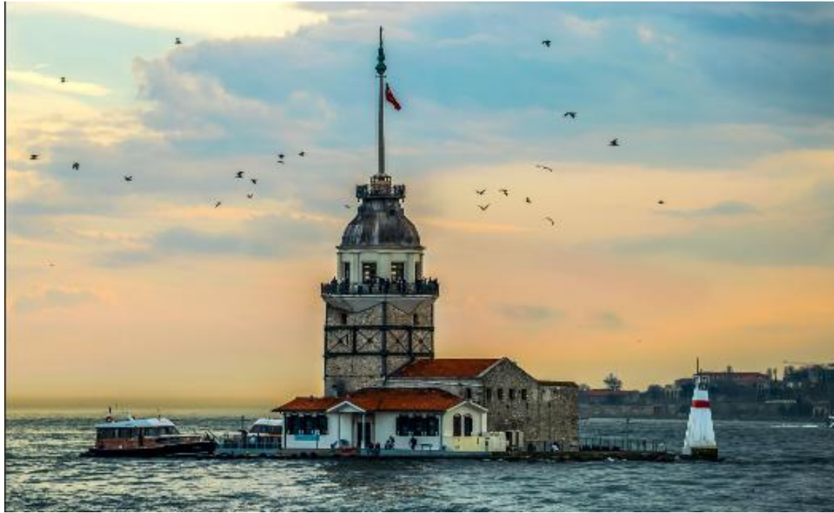
THE LEANDROS TOWER