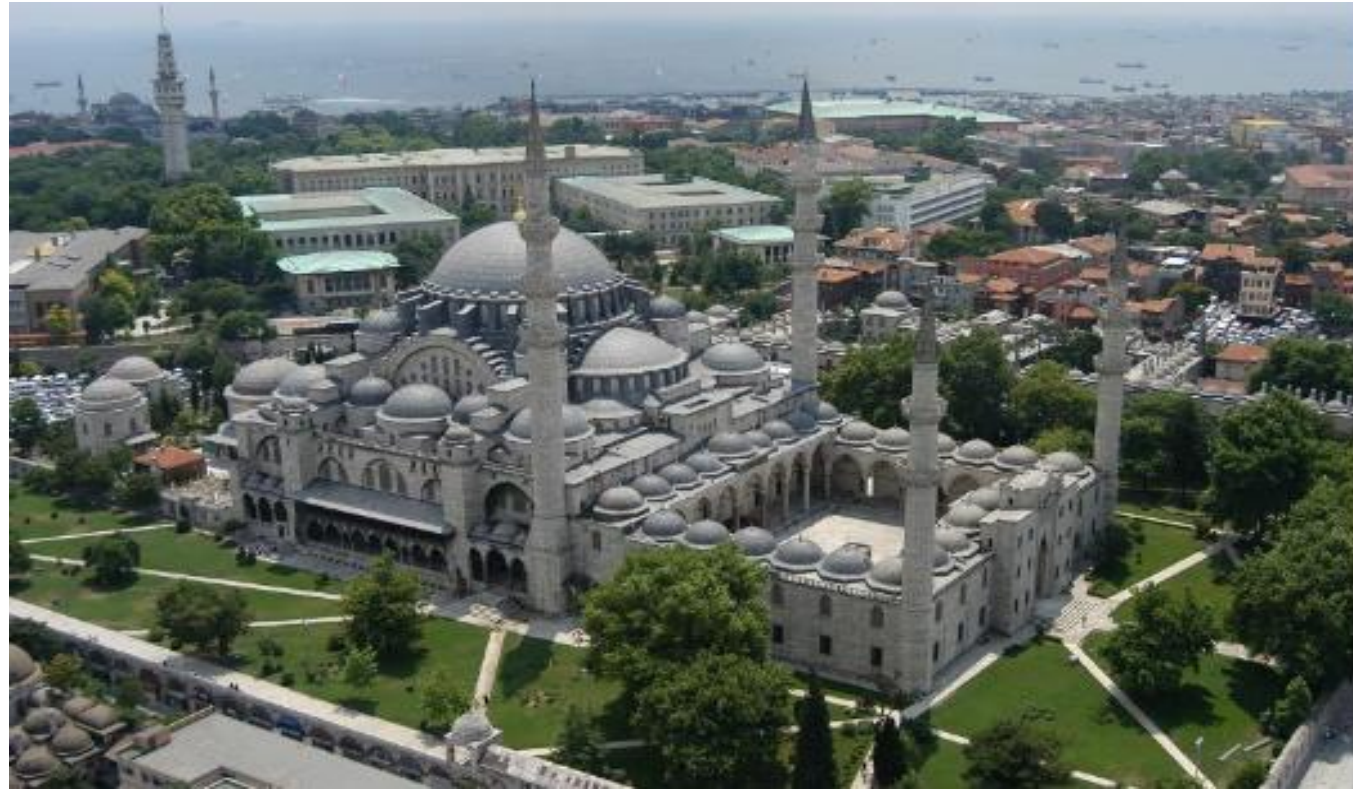
THE SULEYMANIYE MOSQUE