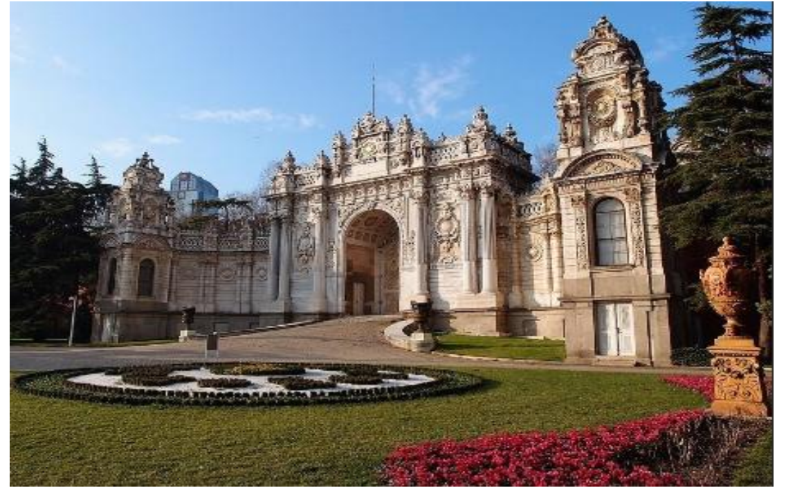
THE DOLMABAHÇE PALACE MUSEUM