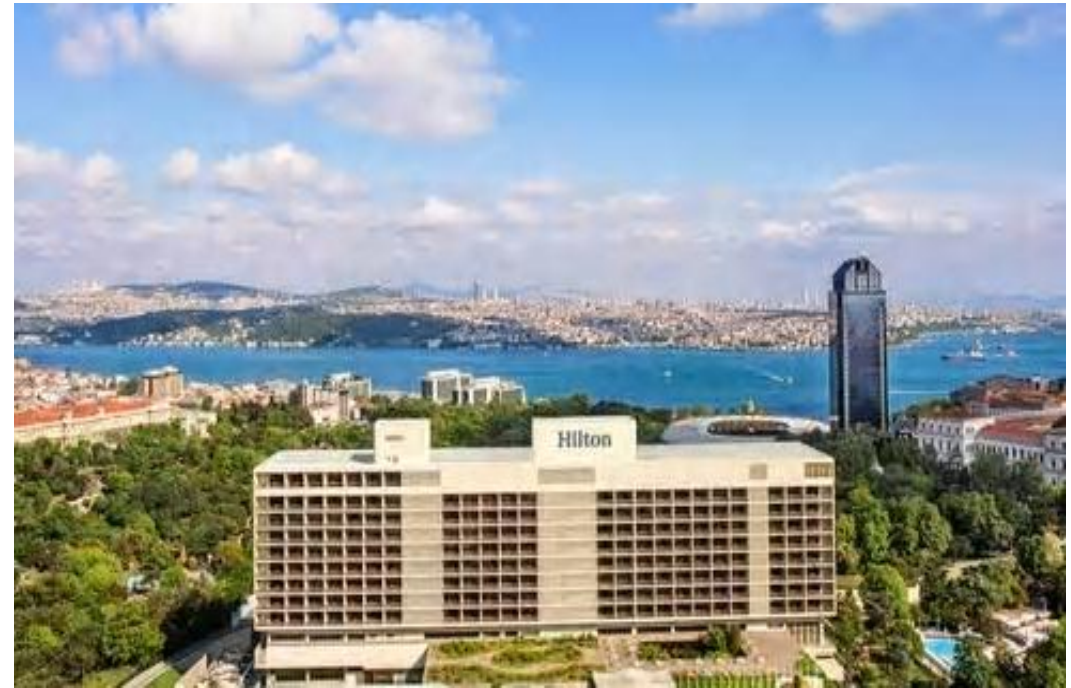
An iconic hotel in the heart of Istanbul Proposed Venue