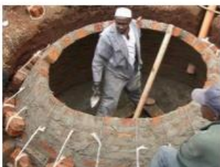
BIOGAS & BIOMASS